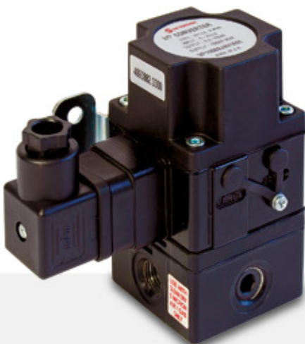
VP10 / 100X